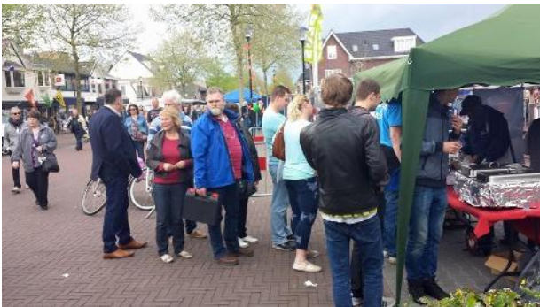
Rush before the storm—literally a lot of rain!