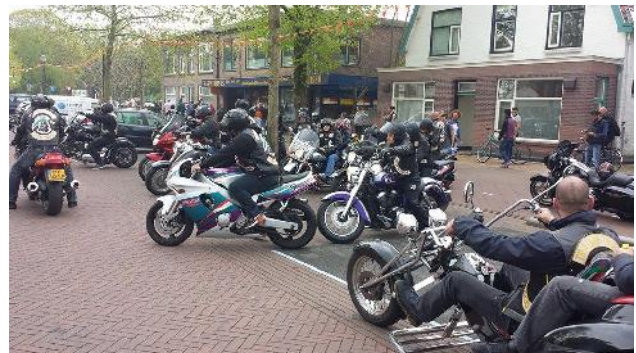
Our best customers this day!