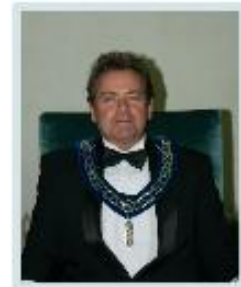
JW Niclass Soellaart

Blazing Star Lodge 26 held its annual election on the 20th of September 2014 in Amersfoort, the Netherlands